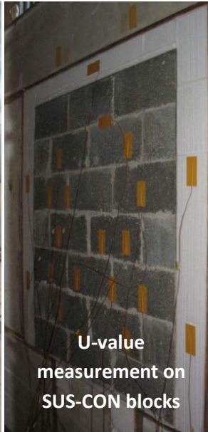
U-value measurement on SUS-CON blocks