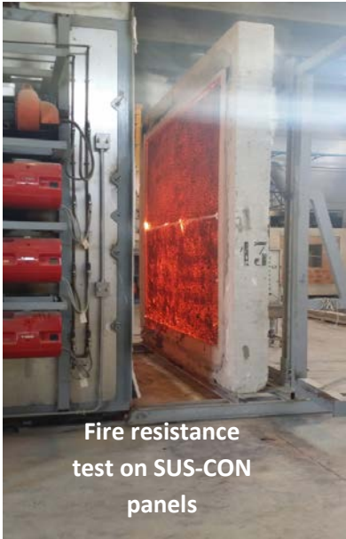
Fire resistance test on SUS-CON panels